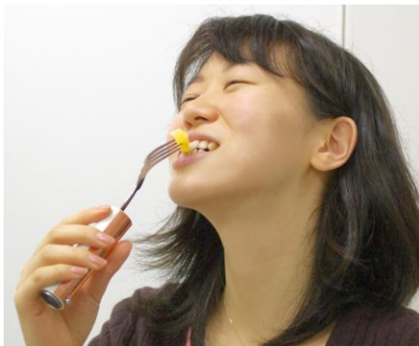
Figure 1: An usage example of EaTheremin.

Many research projects on food environments (e.g., dining tables and dishes) have been proposed recently [1] [2]. In contrast, we focused on the eating act itself, and proposed a fork-type instrument, EaTheremin (Eat + Theremin), which enables users to play various sounds by eating foods. These sounds are changed, according to resistance values of foods attached on the fork.